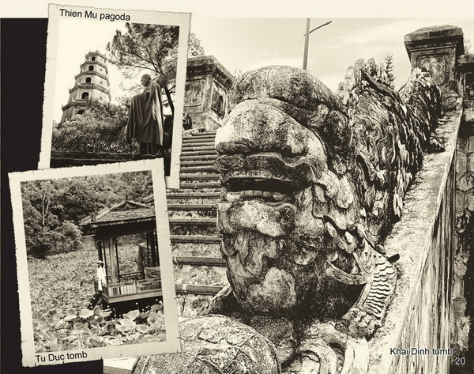
Thien Mu pagoda